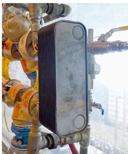
Alfa Laval tantalum heat exchanger installed at PQ Corporation.