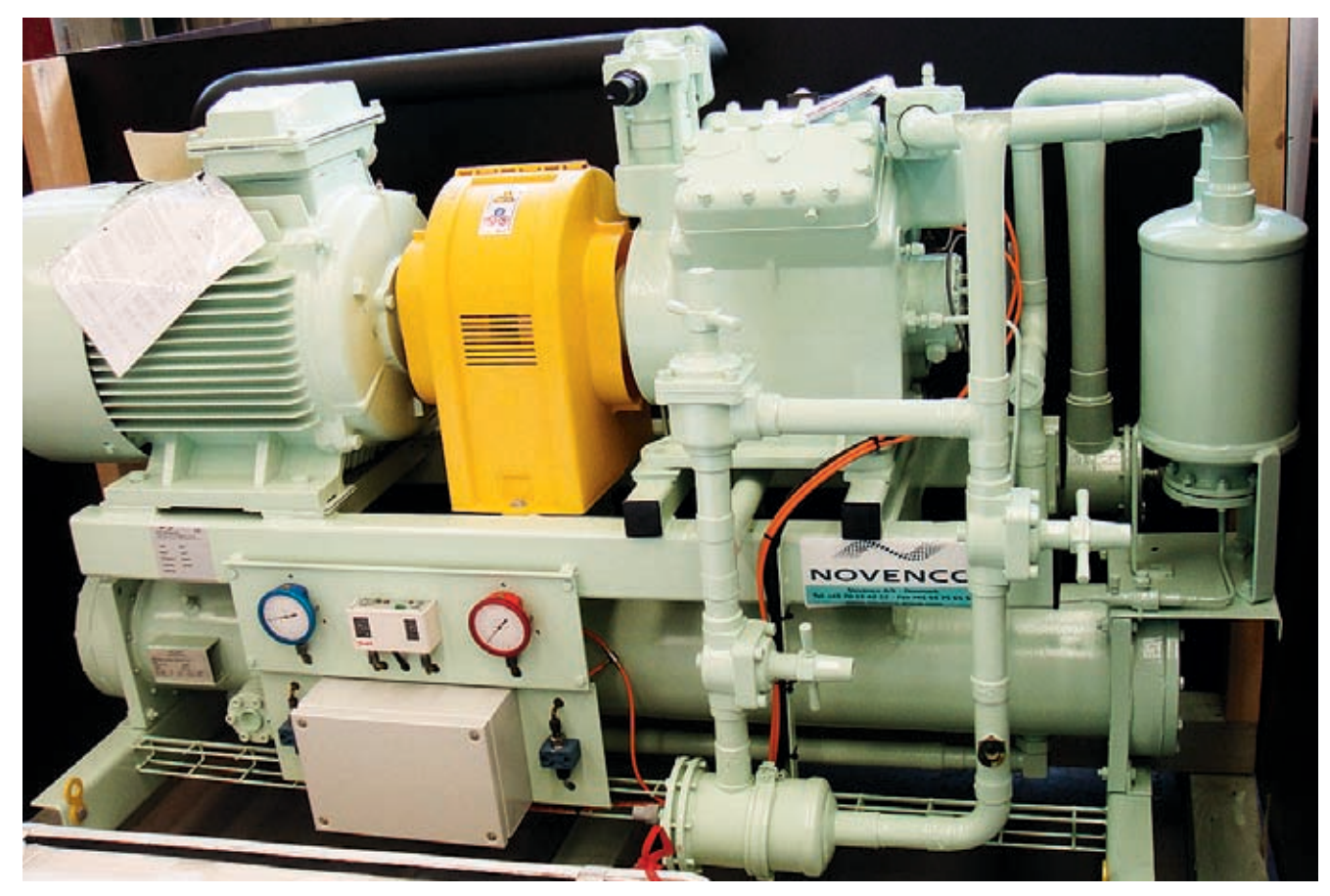
Novenco's air-conditioning and cooling systems are now with Alfa Laval condensers to keep food cool during the long voyage at sea.