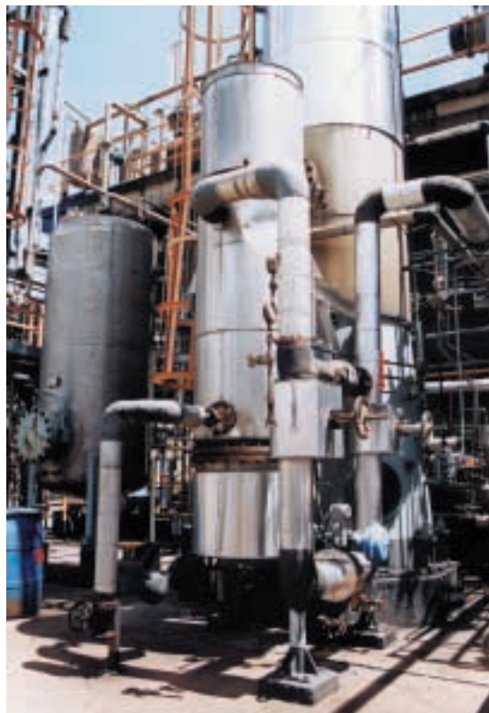
Size comparison: Compabloc versus shell-and-tube reboiler with similar capacity