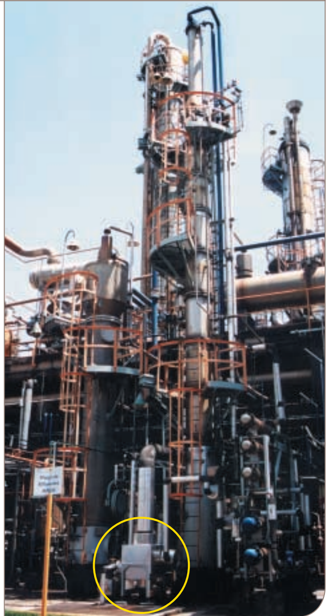
The Compabloc thermosiphon reboiler installed at the Rhodia factory in Paulínia takes up significantly less space than a traditional shell-and-tube. Close-up on next page